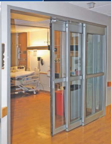
3 Panel ICU/CCU Manual Slider