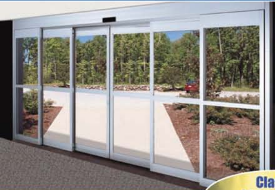
Telescopic Whisper Slider