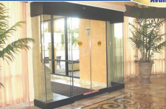
All Glass Whisper Slider

This ultra-quiet, high performance, complete door package has one of the lowest lifetime costs of ownership of any automatic door system on the market today! It is the ideal solution for almost all standard slide door applications. All door configurations in the Whisper Slider series are approved for Class 1 Clean Rooms , making them suitable for critical applications such as operating rooms; pharmaceutical, medical device, semi-conductor and biosensor manufacturing; and research laboratories. The Telescopic system is the perfect solution for limited spaces. It combines space saving versatility with the elegant look of a large clear door opening. It provides an unprecedented 25% more door opening than the standard bi-part model. The elegant All Glass version completely eliminates vertical framing for a sleek modern look . A great choice for showcasing a lobby or manicured grounds.