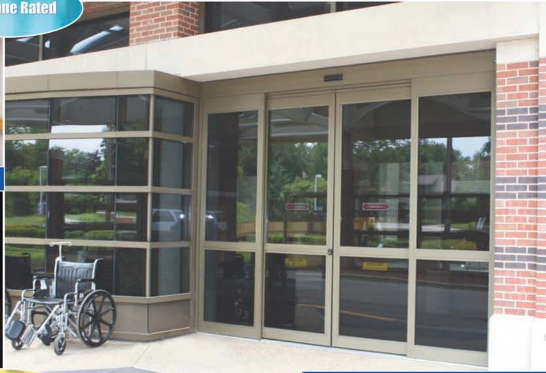
Bi-Parting Whisper Slider