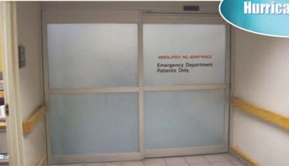
Single Whisper Slider