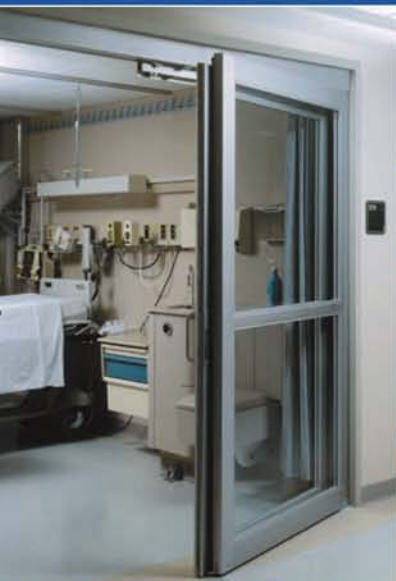
2 Panel ICU/CCU Manual Slider

In intensive care and cardiac care units, large access areas are required for the trouble-free transport of beds, gurneys and other medical equipment. The GT 2100 Series allows users to stack the sliding door and swing panel to one side allowing a large opening access. This series is ideally suited for ICU/CCU rooms designated as "infection control" where airborne germs must be kept from spreading to other areas. These heavy-duty doors are also ideal for corridors where air quality in rooms must be maintained in case of fire.