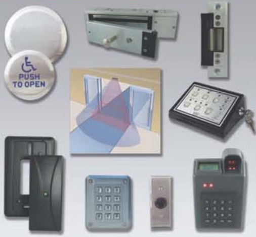
SECURITY ACCESS SYSTEMS